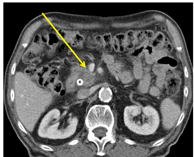
FIG. 1. Pancreatic tumor with a PV/SMV contact smaller than 180^\circ without deformity (arrow) in a patient undergoing pancreaticoduodenectomy without vein resection after neoadjuvant treatment. The final pathology showed the presence of malignant cells at the SMV/PV margin (R1 resection). SMV, superior mesenteric vein; PV, portal vein

During the last decade, improvements in imaging tools and techniques have strengthened the crucial role of the radiologist in PDAC management. Development of high-resolution imaging with thin-slice thickness and multiplanar reconstruction allows better analysis of tumoral extension and the tumor–vessel interface. Magnetic resonance imaging (MRI) performed with specific sequences appears to be very promising, especially in combination with metabolic imaging and conventional CT. 24,25 Diffusion-weighted MRI can identify responding patients upon PDAC restaging after NAT thanks to apparent diffusion coefficient-mapping by monitoring of treatment-induced changes in PDAC and also is more sensitive than CT for imaging of small PDAC liver metastases (83% vs 45%). 23,25 In our opinion, MRI should be prospectively incorporated as part of PDAC staging and restaging after NAT, especially for vascular contact (re)assessment and tumoral changes.